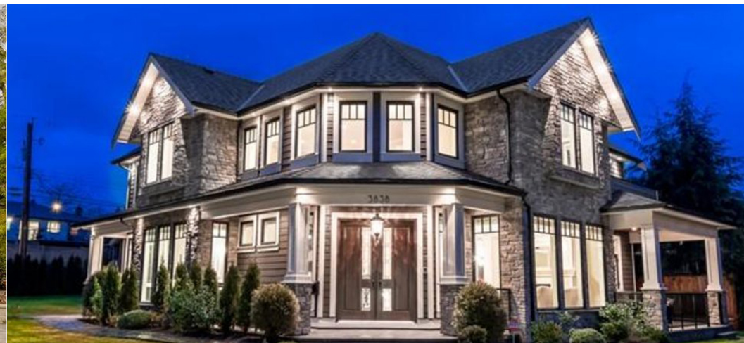
3838 WINLAKE CRESCENT 7 BEDS | 7 BATHS | LOT 10,360 SQ. FT.

BRAND NEW ULTRA LUXURY HOME IN BEAUTIFUL NEIGHBOURHOOD ON HUGE 9940SQFT LOT. HOUSE IS 3 LVLS VERY SPACIOUS WITH HIGHEND FINISH & LUXURY DESIGN THROUGHOUT. UPON ENTERING A GRAND FOYER, THE MAIN FLOOR FEATURES SPACIOUS LIVING ROOM, DINING ROOM, DEN, GREAT ROOM, EATING AREA, CHEF'S KITCHEN WITH HIGHEND STAINLESS STEEL APPLIANCES & GRANITE COUNTERTOP, WOK KITCHEN, PANTRY, MUDROOM, LAUNDRY & POWDER ROOM. UPPER LEVEL FEATURES DELUXE MASTER BEDROOM WITH WALK IN CLOSET & SPA-LIKE 5 PIECE ENSUITE, 3 LARGE BEDROOMS & 2 ENSUITES. BASEMENT FEATURES WINE CELLAR, BAR AREA, HUGE RECREATION ROOM, 1 GUESTROOM & BATHROOM. BASEMENT ALSO HAS A 1 BEDROOM SUITE EQUIPPED WITH LIVING ROOM AND KITCHEN. SCHOOL CATCHMENTS: SEAFORTH ELEMENTARY, ARMSTRONG ELEMENTARY, BURNABY MOUNTAIN SECONDARY, CARIBOO HILL SECONDARY