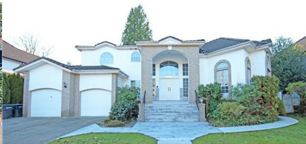
5325 RUGBY AVE 6 BEDS | 5 BATHS | LOT 9,654 SQ. FT. SOLD

BEAUTIFUL CUSTOM-BUILT DELUXE 9 BDRM + DEN, 7 BATHS. LARGE LUXURY HOME IN QUIET SURROUNDING AT SUNCREST. ON HIGH SIDE OF STREET WITH VIEW OF RICHMOND, SPACIOUS 3 LEVEL, OPEN & FUNCTIONAL LAYOUT, ALL TOP QUALITY AND CRAFTSMANSHIP EVERYWHERE, DOUBLE-HEIGHT ENTRY, MAPLE KITCHEN, WOK KITCHEN, TOP OF THE LINE STAINLESS STEEL APPLIANCE, GRANITE COUNTER, RADIANT FLOORS WITH HEAT PUMP, A/C, HRV, SOUND-PROOF THEATER ROOM/MEDIA ROOM, HIGH CEILING, 2 VIEW BALCONIES OFF UPPER BEDROOMS AND COVERED DECK + PATIO, PERFECT FOR ENTERTAINING, BBQ AND PARTIES! BSMT: 2/3 BDRM SEP. ENTRY! SCHOOL CATCHMENT: SUNCREST ELEMENTARY, BURNABY SOUTH SECONDARY. IDEAL FOR A LARGE FAMILY EASY ACCESS TO METRO TOWN, VANCOUVER, RICHMOND.