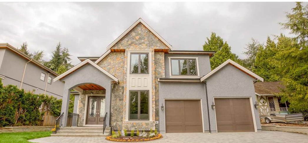
8243 GOVERNMENT ROAD 6 BEDS | 6 BATHS | LOT 9,940 SQ. FT.

A MAGNIFICENT LUXURY HOME ON A LARGE 8118 SQFT LOT WITH VIEW. COME AND SEE THE BEST HOME IN THE AREA. IDEAL FOR A GROWING FAMILY TO ENJOY THE SOUTHERN BREATH-TAKING VIEW. THE BACK OF THE HOUSE HAS AN INCREDIBLE OUTDOOR COVERED DECK SPACE WITH A TV & A BBQ. LOWER LEVEL HAS A LARGE ENTERTAINING PATIO, PERFECT FOR LARGE GATHERINGS & ENTERTAINING. THE MAIN FLOOR HAS A WARM & BRIGHT ENTRY, A BEAUTIFUL KITCHEN EQUIPT WITH PROFESSIONAL APPLIANCES AND A FAMILY ROOM WHICH HAS A DOUBLE HIGH CEILING. PLUS MANY MORE FEATURES.