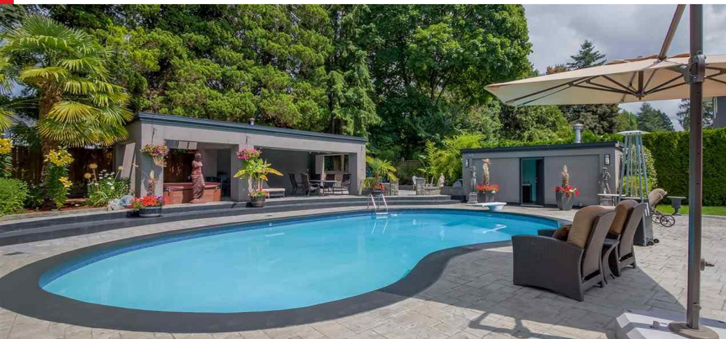
7989 GOVERNMENT ROAD 4 BEDS | 5 BATHS | LOT 30,300 SQ. FT.