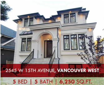
2545 W 15TH AVENUE, VANCOUVER WEST 5 BED | 5 BATH | 6,250 SQ.FT.