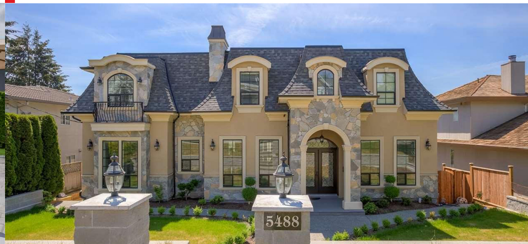
5488 EWART STREET 5 BEDS | 7 BATHS | LOT 4,736 SQ. FT.

THIS IS A SPECTACULAR, RARE, ONE OF A KIND 30,300SQFT LOT ESTATE IN A PRESTIGE NEIGHBOURHOOD. THIS HIDDEN GEM IS WALKING DISTANCE TO CELEBRITY NEIGHBOURHOOD SCHOOL, PARKS, TRANSIT & COSTCO JUST DOWN THE STREET. THE MAIN FLOOR IS SPACIOUS & FEATURES HIGH CEILING LIVING ROOM, DINING ROOM, OPEN GOURMET KITCHEN, EATING NOOK, FAMILY ROOM, LARGE MASTER ROOM W WALK-IN CLOSET, 5 PIECE MASTER SPA WITH LARGE BATH IN SHOWER, GUEST POWDER ROOMS. UPPER LEVEL FEATURES 2 BEDROOMS, LOFT AREA & BATHROOM. LOWER LEVEL HAS 1 LARGE BEDROOM, WALKIN & A LARGE MULTIPURPOSE RECREATIONAL ROOM WITH SEPARATE ENTRANCE. BACK YARD IS A RELAXING OASIS WITH LARGE POOL FOR PARTIES & FAMILY FUN. SCHOOL CATCHMENTS: SEAFORTH ELEMENTARY, ARMSTRONG ELEMENTARY, BURNABY MOUNTAIN SECONDARY, CARIBOO HILL SECONDARY.