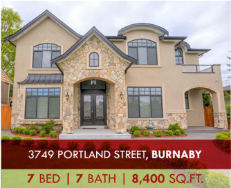
3749 PORTLAND STREET, BURNABY 7 BED | 7 BATH | 8,400 SQ.FT.