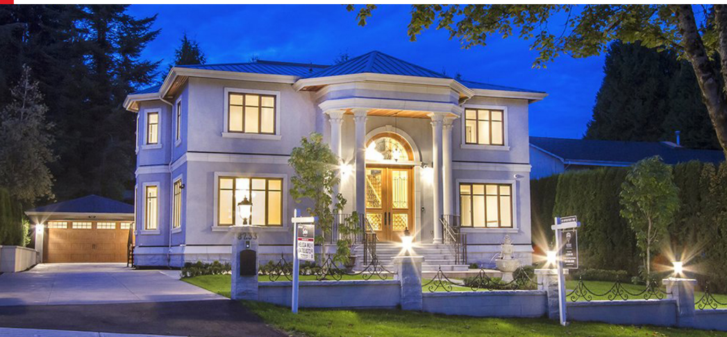
8233 GOVERNMENT ROAD 7 BEDS | 7 BATHS | LOT 10,500 SQ. FT. SOLD

EUROPEAN PALACE, ELEGANCE, NEW HOME COMFORT & LUXURY FOR ROYALTY! SPECTACULAR HOME CREATED & HAND CRAFTED BY JENIA DESIGN & FINISHING, IN DESIRED GOVERNMENT ROAD. CUSTOM ARTISAN DETAILS INCLUDE: 14 FT HIGH BOOK MATCHED WHITE OAK DOORS, WHIT EOAK FLOORS, CUSTOM HIGH END LUSH CARPETS, CUSTOM ORDER SILK WALL COVERS, ARTISAN WALL FINISHING, TAMPORED PORCELAIN TILES, THERMADOR APPLIANCES. ARCHITECTURAL DETAILS: IMPRESSIVE 20 FT HIGH CATHEDRAL ENTRY, 3 FLR DUMBWAITER, WINE CELLAR, COFFERED CEILING W/ BAROQUE INSPIRED, ARTISAN PAINTED ELEMENTS, 24 CARAT GOLD LEAF ACCENTS, HAND CRAFTED PILLARS, ARCHES, PILASTERS, "GRAND FOYER" W/ INLAID MARBLE FLOORING. GREAT HALL INSPIRED LVRM W/ 20 FT FLOOR TO CEILING WINDOWS, IMPRESSIVE STONE F/P MANTLE.