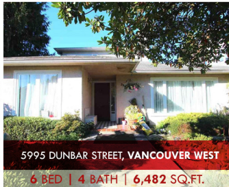
5995 DUNBAR STREET, VANCOUVER WEST 6 BED | 4 BATH | 6,482 SQ.FT.