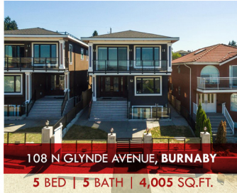
108 N GLYNDE AVENUE, BURNABY 5 BED | 5 BATH | 4,005 SQ.FT.