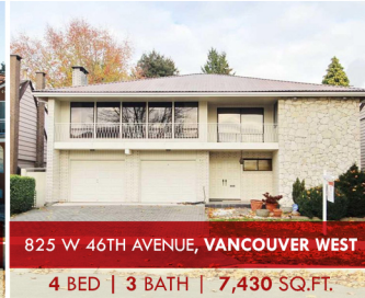
825 W 46TH AVENUE, VANCOUVER WEST 4 BED | 3 BATH | 7,430 SQ.FT.