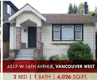
4517 W 16TH AVENUE, VANCOUVER WEST 2 BED | 1 BATH | 4,026 SQ.FT.

EXCEPTIONAL SERVICE AND SELL YOUR PROPERTY FOR TOP DOLLAR.