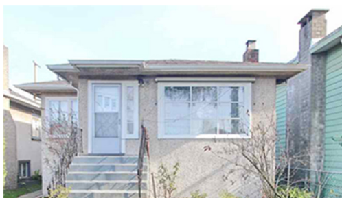
8480 OAK STREET