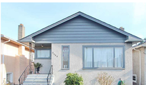
8468 OAK STREET