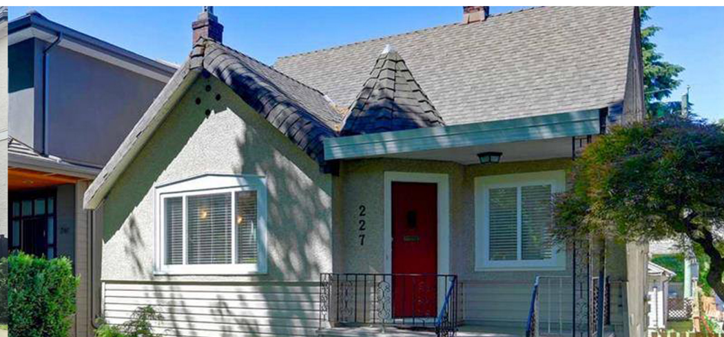
227 W 22ND AVENUE 3 BEDS | 1 BATHS | LOT 4,026 SQ. FT. SOLD

ALERT! INVESTORS, BUILDERS & ALL HOUSE HUNTERS! RARE OPPORTUNITY HOME IN KERRISDALE WITH A POTENTIAL SUBDIVIDABLE LOT! WITH 2 PID. THIS DELIGHTFUL & COZY 3-STOREY HOME INCLUDES A LIVING ROOM, DINING & EATING AREA, KITCHEN & 2 BEDROOMS ON THE MAIN FLOOR. THE UPPER UNIT FEATURES A MASTER BDRM & 1 BEDROOM. THE BASEMENT SUITE CONSISTS OF A SEPARATE ENTRANCE ALLOWING POTENTIAL SUITE TO BE RENTED OUT. THE OWNER(S) MAY LIVE ON THE MAIN & TOP FLOOR. SOUTHERN-DESIGNED BACKYARD WITH A HUGE DECK, SIDEYARD & LARGE OPEN PARKING. HOT! HOT! HOT! CURRENTLY FIXING THE ROAD FOR THE MONTH. DRIVE TO THE ALLEY & PARK AT THE BACK FOR THE SHOWINGS.