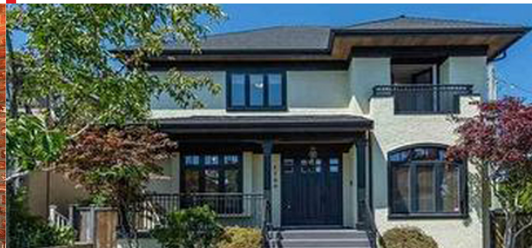
2828 W 33RD AVENUE 4 BEDS | 5 BATHS | LOT 3,900 SQ. FT. SOLD

AMAZING ONE OF A KIND CONTEMPORARY DESIGNED FAMILY HOME LOCATED IN SOUTH GRANVILLE! THIS SPACIOUS & TASTEFULLY RENOVATED 2 STOREY HOME W/BSMT IS A DREAM! UPDATED FLOORING, PAINT, LIGHTING, ROOF, HEATING & MUCH MORE! WALKING INTO THE HOUSE, GRAND LIVING/DINING/FAMILY ROOM/EATING AREA, HAS A RELAXING & CHIC FEEL. WHILE THE KITCHEN W/STAINLESS STEEL APPLIANCES, WINE COOLER, MARBLE COUNTERTOPS W/BRICK PANELED ADDS A RUSTIC CHARM! THE 3RD FLOOR FEATURES A COZY MASTER BEDROOM, 3 BEDROOMS & DEN. THE BASEMENT SUITE FULLY REDONE LIVING/DINING ROOM, KITCHEN, NOOK, MASTER BEDROOM & 2 BEDROOMS BEST FOR HAVING GUESTS/RENTALS! THE BACKYARD IS FUN FOR THE WHOLE FAMILY! A FULLY FENCED COURT FOR BASKETBALL/HOCKEY RINK!