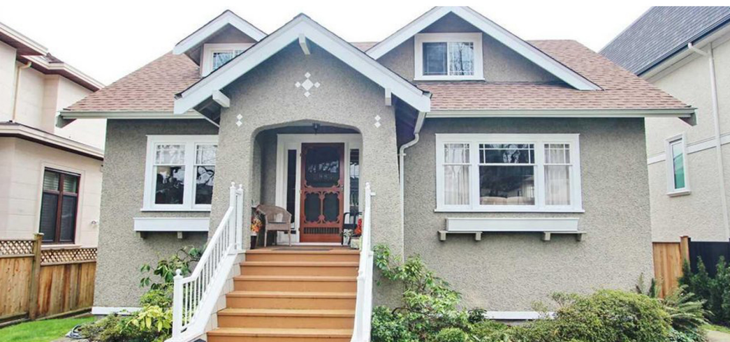
2984 W 39TH AVENUE 5 BEDS | 3 BATHS | LOT 6,373 SQ. FT. SOLD

BEAUTIFUL HOME IN MACKENZIE HEIGHTS WITH LEGAL MORTGAGE HELPER. FANTASTIC LOCATION. HIGH QUALITY THROUGHOUT. 6 ZONE RADIANT HEATING, 9 FT CEILINGS, OPEN CONCEPT, CHEF'S KITCHEN W/ SUB ZERO FRIDGE, WOLF 5 BURNER GAS COOKTOP, FABULOUS WINE FRIDGE, CUSTOM CABINETRY, SOUTH FACING BACKYARD. THIS HOME IS PERFECT FOR A GROWING FAMILY. 3 BEDROOMS UP WITH VAULTED CEILINGS. MASTER BEDROOM HAS A WONDERFUL SOUTH FACING DECK AND THE SPA-LIKE BATHROOM IS SPACIOUS. CONTEMPORARY FINISHING. KOHLER AND DURAVIT BATH FIXTURES. LOWER LEVEL HAS A MEDIA ROOM AND 1 BEDROOM LEGAL SUITE OR NANNY'S QUARTERS.