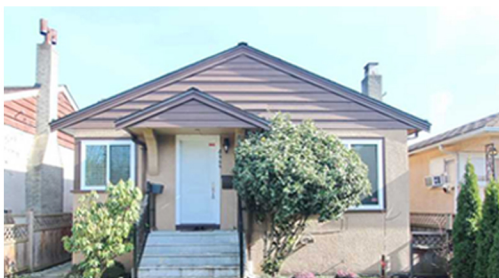
8444 OAK STREET

SCHOOL CATCHMENTS: SIR WILFRID LAURIER ELEMENTARY AND SIR WILFRID LAURIER ANNEX.