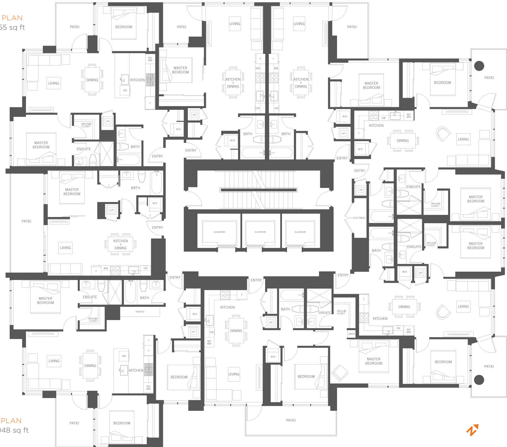
K PLAN 850 sq ft